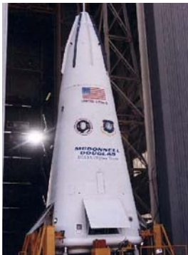
The Delta Clipper

Blue Road Research is working to integrate our sensors with complete interrogation systems for both on-the-ground periodic structural integrity monitoring as well as airborne dynamic structural performance monitoring. Applications include advanced high-performance multiple use vehicles (such as the UCAV pictured above) and existing vehicles such as commercial aircraft, military aircraft, and composite missile bodies.