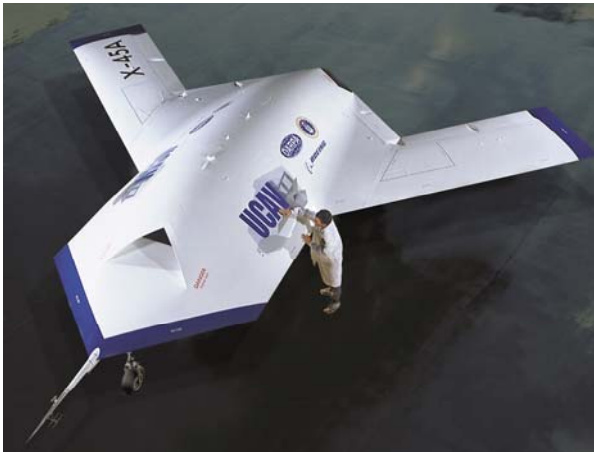
Unmanned Combat Air Vehicle

Blue Road Research has applied fiber optic sensors to a variety of aerospace programs and is a leader in the development of technology and techniques necessary to measure structural performance of composite and metal alloy airframes. Current sensor development efforts include both surface-mount and embedded measurements in advanced airframes, cryogenic fuel tanks, rocket booster fuel casings and composite patches on aging structures.