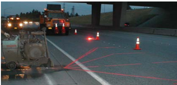
Installing sensors for traffic monitoring on the Interstate 84 Freeway east of Portland, Oregon

Blue Road Research has been working closely with the Oregon Department of Transportation for several years. This work has ranged from verifying the performance of composite reinforcement of the structural members on the historic Horsetail Falls Bridge to traffic classification along the I-84 freeway using strain sensors embedded in the roadway.