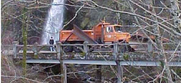
Horsetail Falls Bridge, Columbia Gorge, Oregon

Blue Road Research is a pioneer and leader in the application of fiber optic sensors for static and dynamic measurements of bridges, highways, buildings, piers and dams. Current structural health monitoring efforts are focusing on the use of fiber Bragg grating strain sensors in performing damage detection through modal analysis on complete structures.