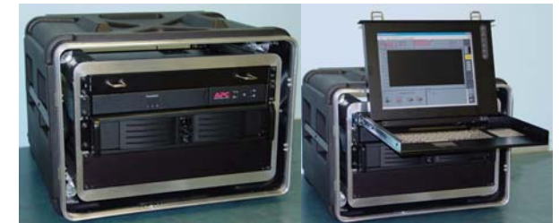
Custom Sensor Workstation

Blue Road Research provides its customers with equipment, documentation, software and technical assistance.