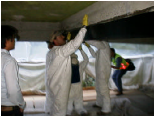
Figure 4: Installation of the Carbon-Epoxy Strengthening Material.

Carbon fiber sheets impregnated with resin were then adhered to the bottom and the lower part of the sides of all transverse beams on the structure for flexural control (shown in figure 4).