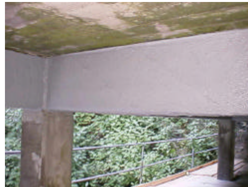
Figure 6: A Cosmetic Coat of Epoxy was Applied to the Composites.

More extensive laboratory tests on full-scale model beams are scheduled. The beams will be outfitted with sensors and composite wraps similar to what was done on the Horsetail Falls Bridge. It is planned to load the beams to failure. The results of these laboratory tests will be used in combination with data obtained from the Horsetail Falls Bridge (see figure 7) to verify finite element models of the original beams and the composite strengthened beams.