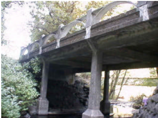
Figure 1: Horsetail Falls Bridge.

Twenty-eight fiber-grating sensors were used to instrument two reinforced concrete beams that were externally strengthened with composites on the historic Horsetail Falls Bridge in the Columbia River Gorge. Sensor assemblies were placed in the beams and mounted on the outside of the composite to provide performance data.