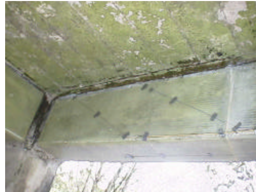
Figure 5: Sensors are Mounted onto the Glass-Epoxy Material after Curing Sufficiently.

Load testing similar to the first tests are scheduled on a monthly basis for the next two years.