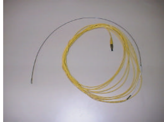
Figure 3: A 70cm Gauge Length Fiber Optic Strain Sensor and Cable.

The actual gratings have a gauge length on the order of a centimeter. Sensors with an effective gauge length of 70cm and 100cm long were desired. The fiber Bragg gratings were mounted in a capillary tubes, cut to 70cm and 100cm lengths, with an outer diameter of 1.6mm and inner diameter of 250 \mu . The tubing is made of a polymer called PEEK, poly-ether-ether-keytone. During fabrication the grating was placed approximately in the center of the tube and epoxied at one end. When the epoxy was cured, a known mass was attached to the opposite end so as to pre-strain the Bragg grating by approximately 1000 \mu strain. After the free end of the grating was epoxied to the tube, the fiber was then spliced to a rugged simplex single-mode patch cord. Shrink tube and splice protectors were used to cover any bare fiber. A picture of one sensor is shown in figure 3.