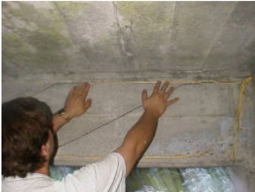
Figure 2: Installation of Long Gauge Length Bragg Grating Sensors into a Beam.

Several innovations were demonstrated in the design of the sensors for the bridge. Very small flexible tubing was used to support and protect the Bragg gratings while being placed into small grooves (figure 2) in the concrete beams as well as directly onto the composite. Small size was important to avoid altering the appearance of the bridge while allowing both the concrete beam and composite to be independently monitored.