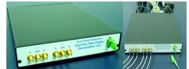
Blue Road Research Dual Axis Fiber Grating Demodulation Unit

Blue Road Research offers a selection of both fiber optic sensors and readout systems for strain (axial, transverse and shear), temperature, pressure and moisture measurement. High speed fiber strain sensing systems at speeds in the range of 10 kHz to 2 MHz are standard, with custom options in the 10 MHz to 20 MHz range. The sensors and systems are suitable for either laboratory experimentation or product line development. We provide our customers with equipment, documentation, software and technical assistance.