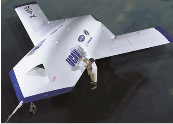
Unmanned Combat Air Vehicle

BLUE ROAD RESEARCH is working to integrate our sensors with complete interrogation systems for both on-the-ground periodic structural integrity monitoring as part of a routine inspection and maintenance program, as well as in-flight dynamic structural performance monitoring which may be used to augment flight control and other dynamic vehicle systems.