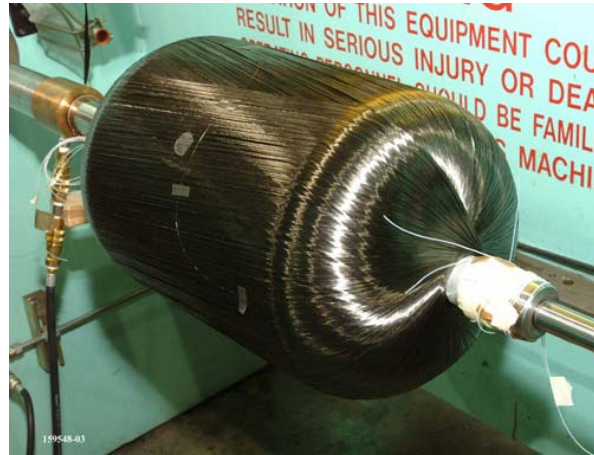
Casing with Embedded Fiber Grating Strain Sensors

BLUE ROAD RESEARCH provides its customers with sensors that are intrinsically safe for use near combustible fuels and in high E&M fields. They are light weight and mechanically stable, making them ideal for aerospace applications.